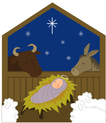
The reason for the season!