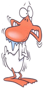
Fourth Annual Polar Duck Dip!

Occohannock on the Bay Camp and Retreat Center will host the fourth annual Polar Duck Dip on Saturday, January 28 th , at the camp beginning at 11:00, with the Dip at 12 noon. Occohannock has a special place in the heart of the Emmaus community, so consider being a duck. Or come to this benefit event to support a dipper.