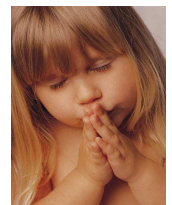
Prayer is a powerful gift.