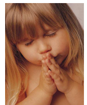
Prayer is a powerful gift.