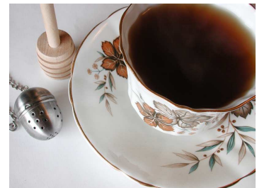
"Drinking From My Saucer"