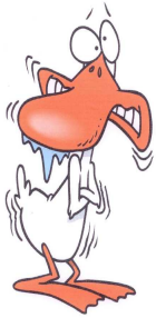
Fourth Annual Polar Duck Dip!

Occohannock on the Bay Camp and Retreat Center will host the fourth annual Polar Duck Dip on Saturday, January 28 th , at the camp beginning at 11:00, with the Dip at 12 noon. Occohannock has a special place in the heart of the Emmaus community, so consider being a duck. Or come to this