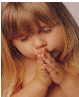
Prayer is a powerful gift.