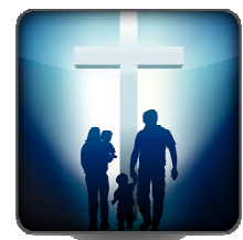
“In the Presence of Jehovah...”