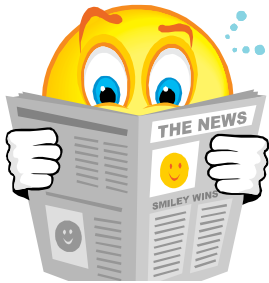
"The Walk Way" A newsletter for the Eastern Shore Emmaus Community.